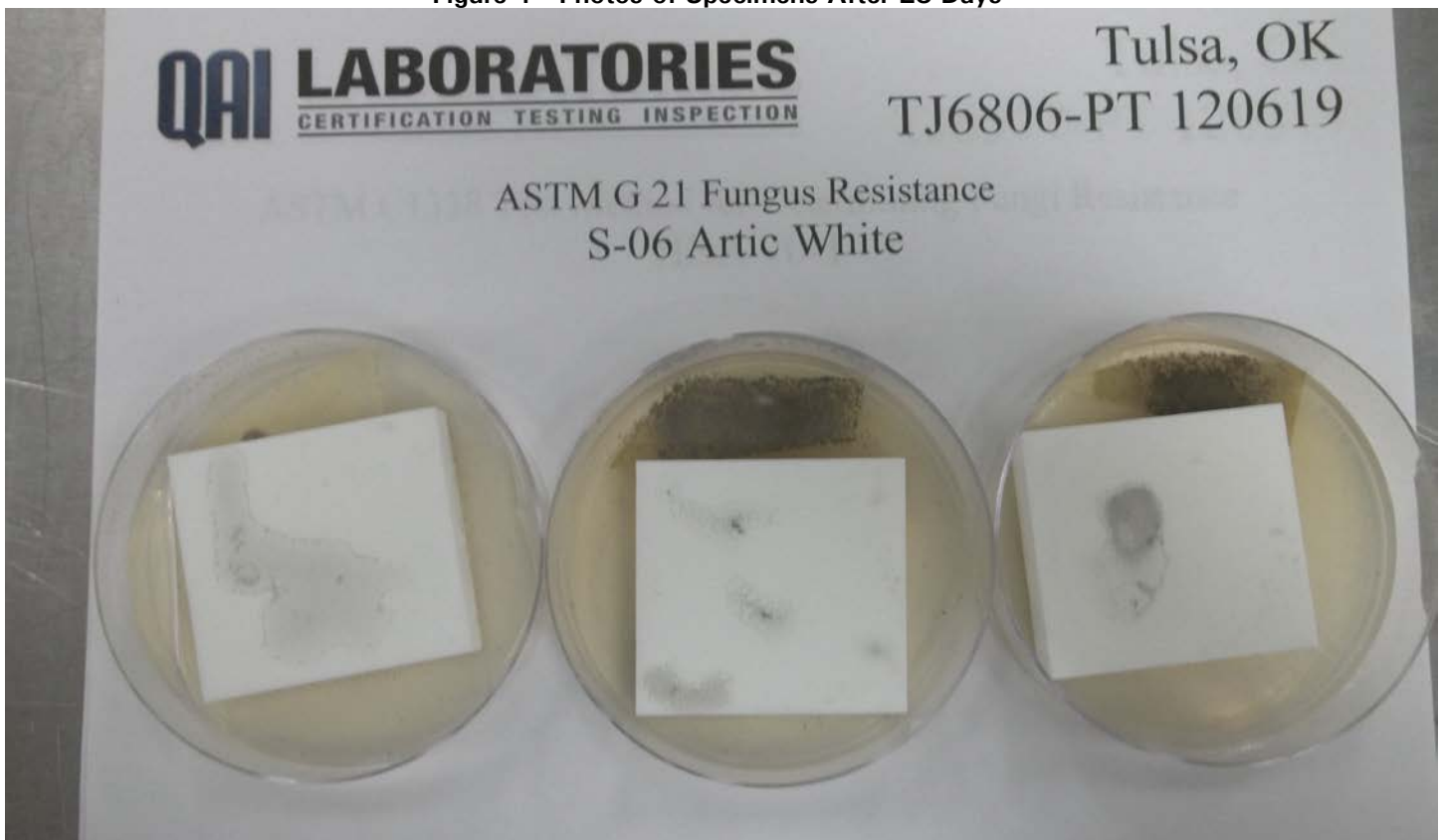
Figure 1 - Photos of Specimens After 28 Days